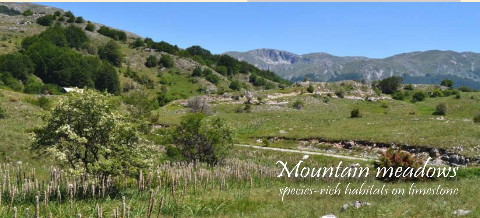
Mountain meadows species-rich habitats on limestone