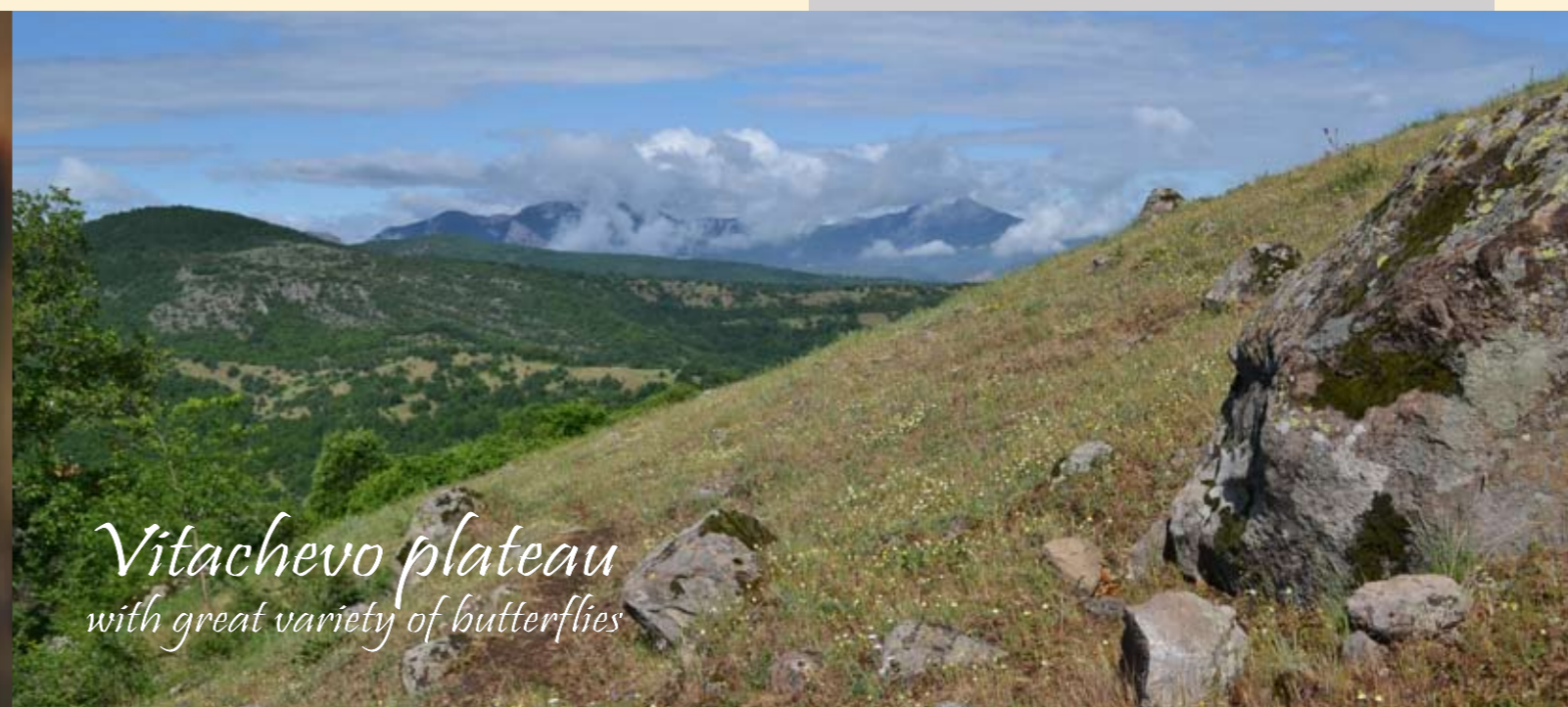
Vitachevo plateau with great variety of butterflies