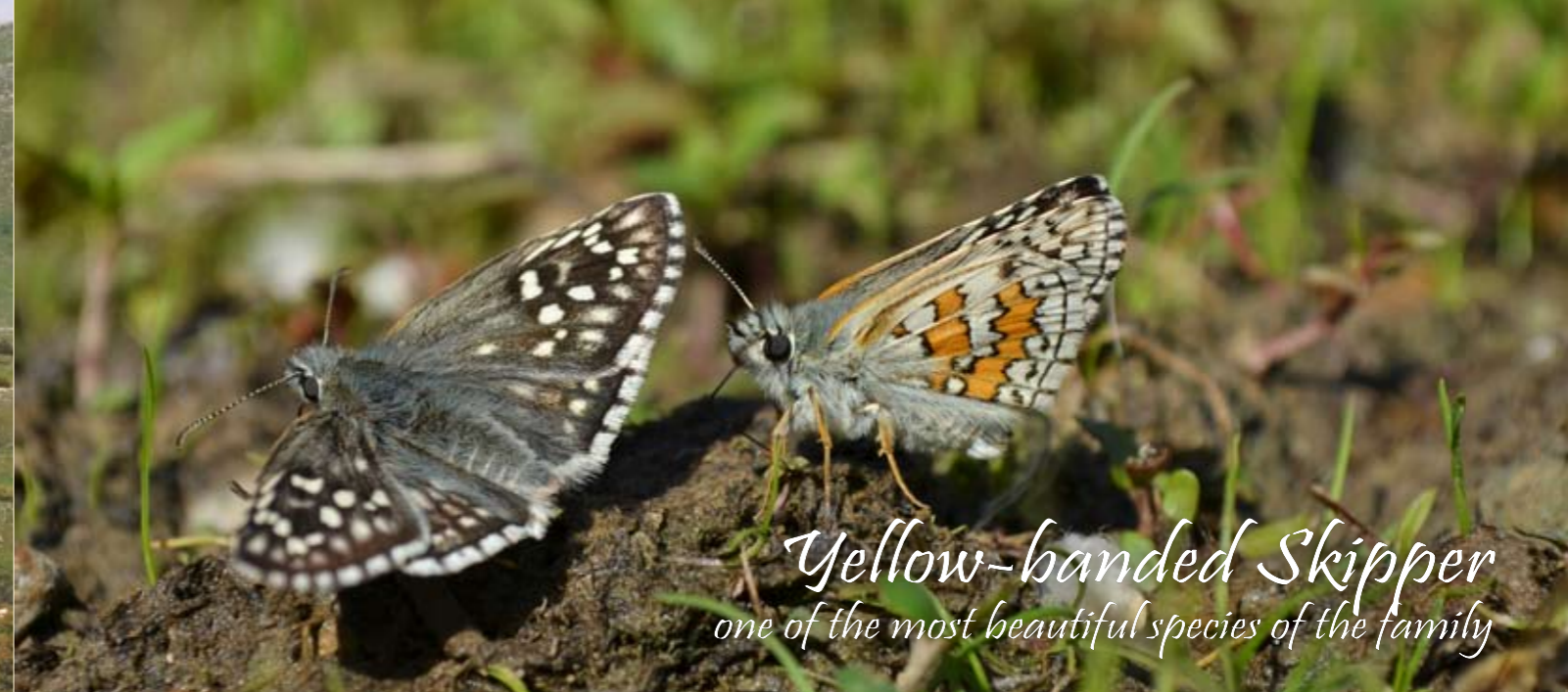
Yellow-banded Skipper one of the most beautiful species of the family