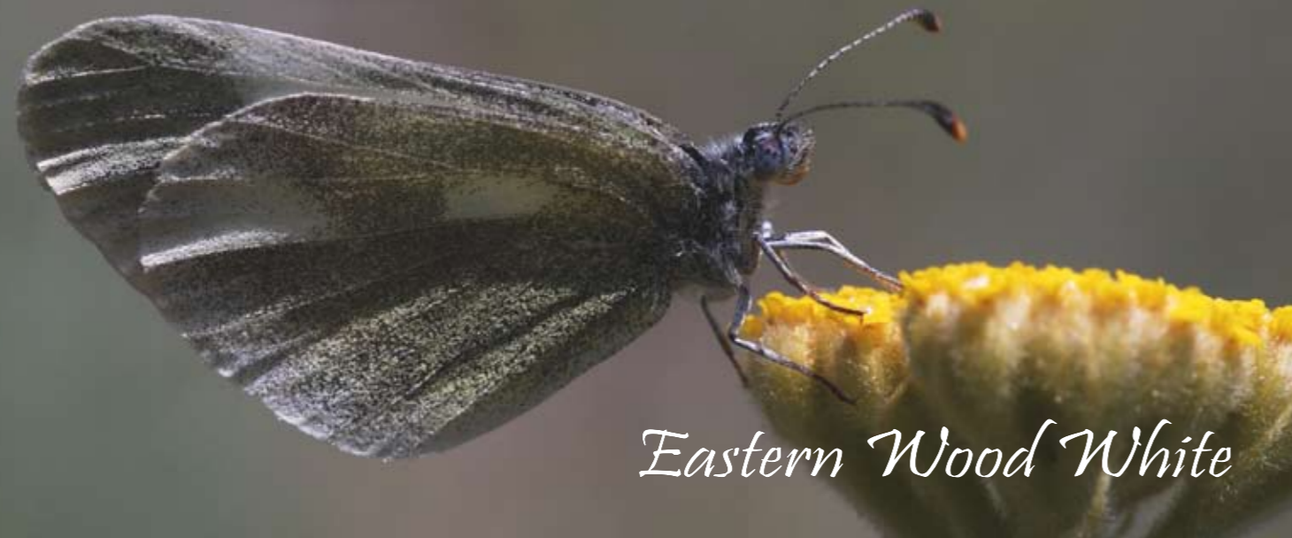
Eastern Wood White