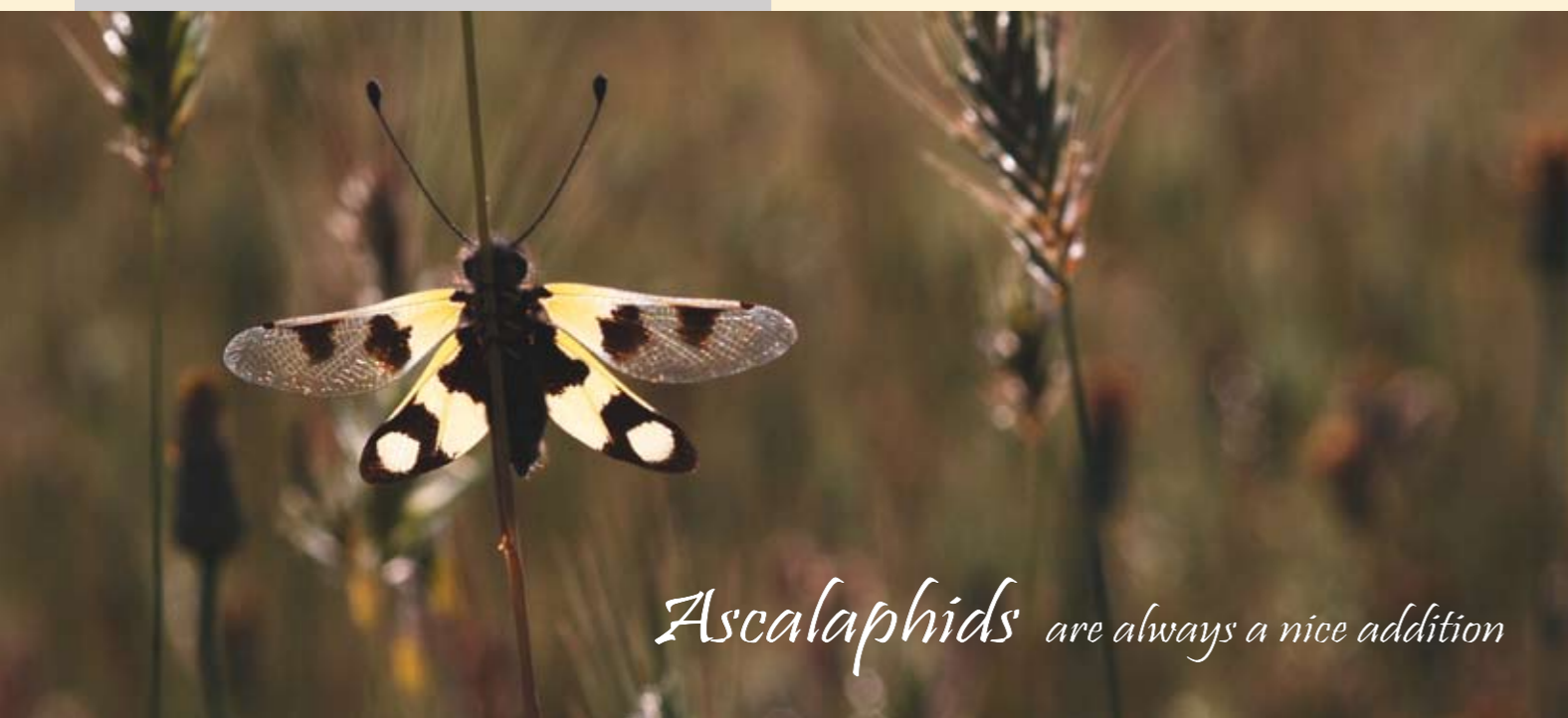
Ascalaphids are always a nice addition