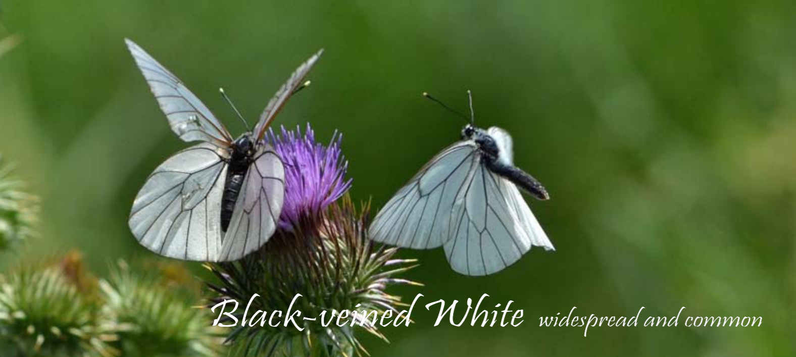
Black-veined White widespread and common