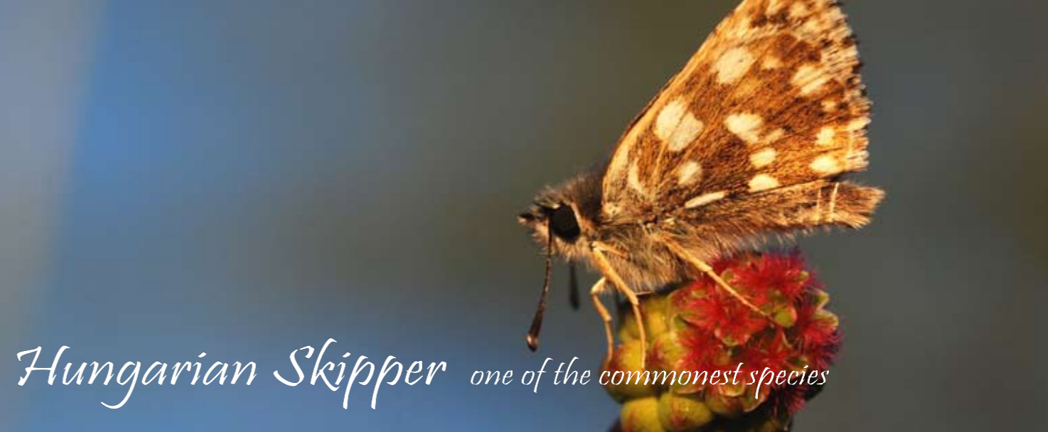
Hungarian Skipper one of the commonest species