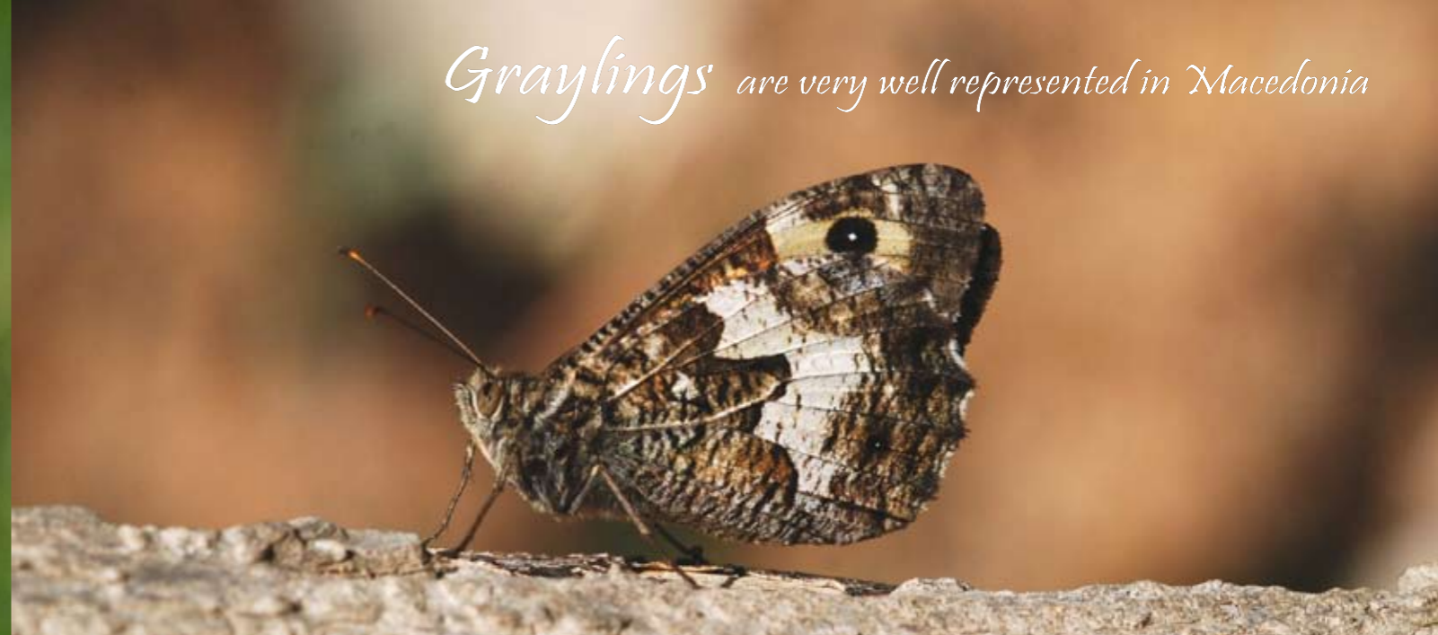
Graylings are very well represented in Macedonia