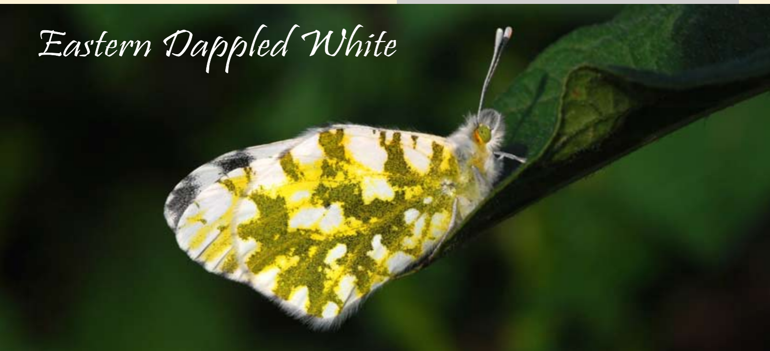
Eastern Dappled White