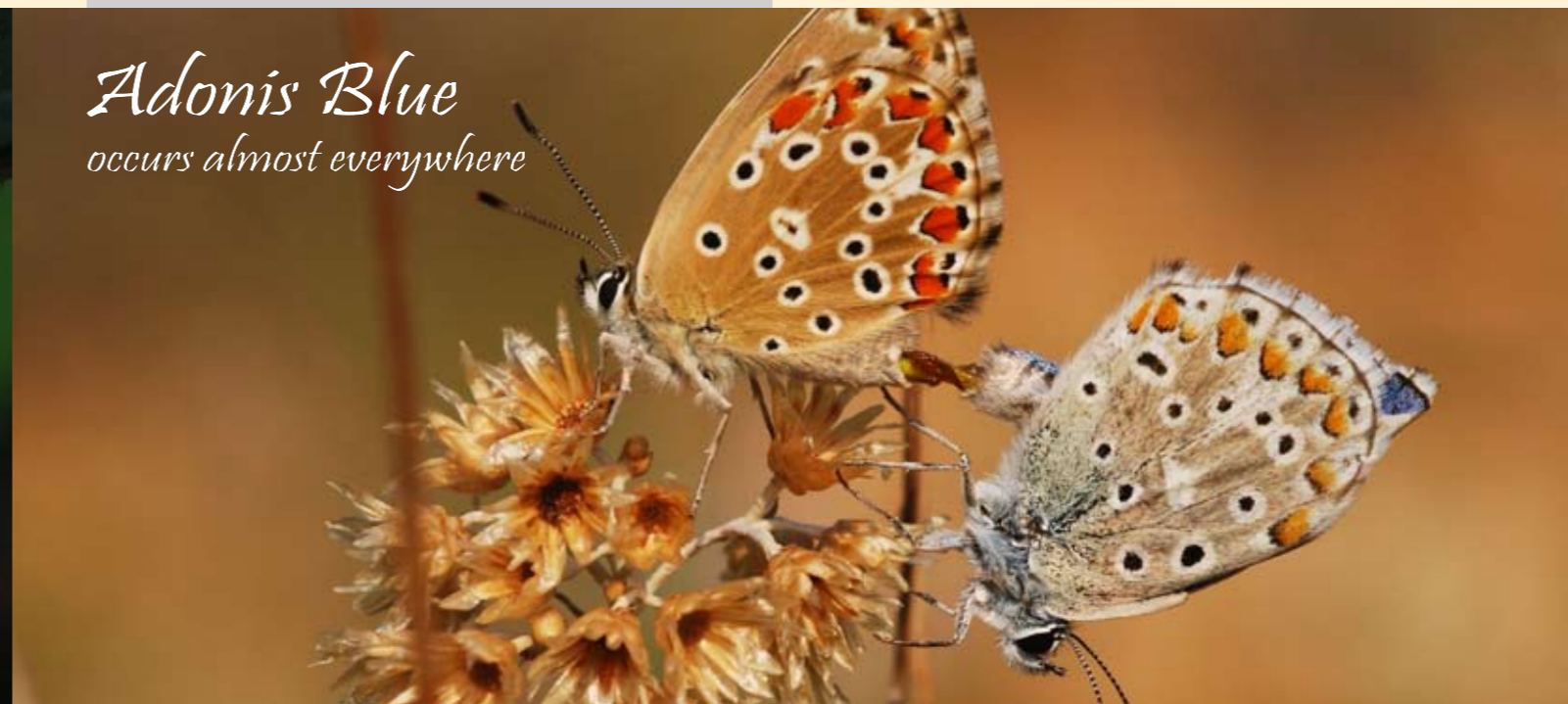
Adonis Blue occurs almost everywhere