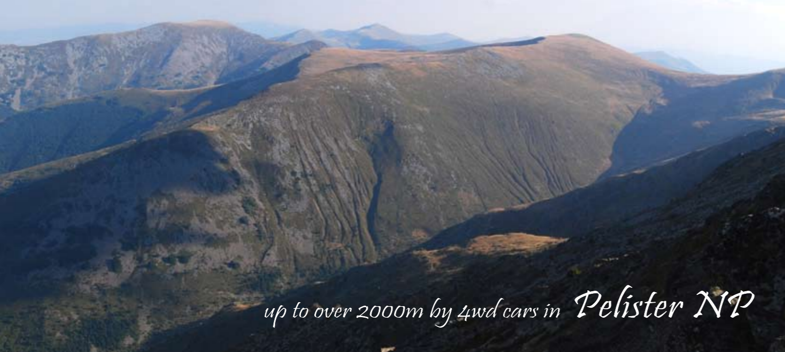
up to over 2000m by 4wd cars in Pelister NP