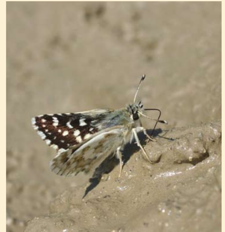
Left: Lang's Short-tailed Blue | Right: Persian Skipper