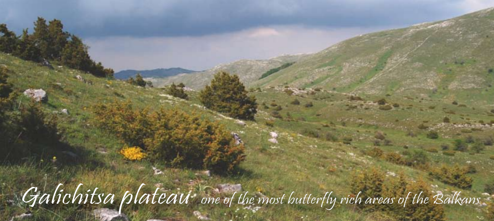
Galichitsa plateau one of the most butterfly rich areas of the Balkans