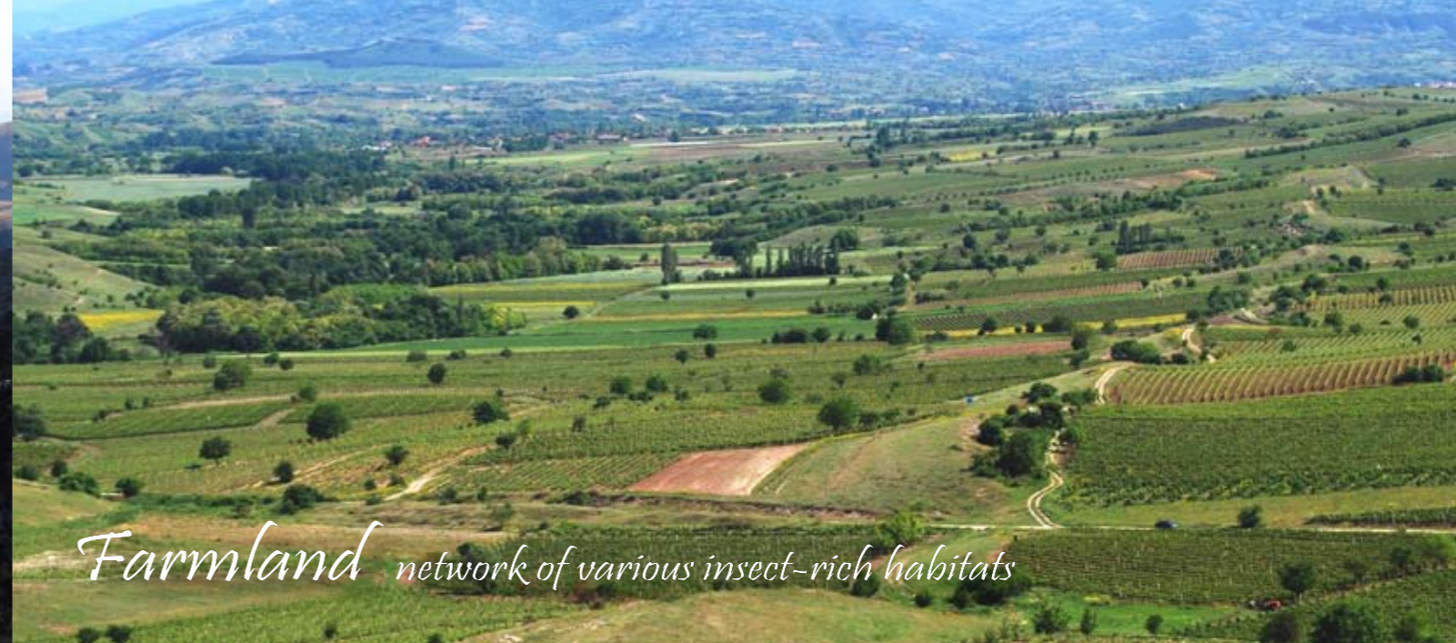
Farmland network of various insect-rich habitats