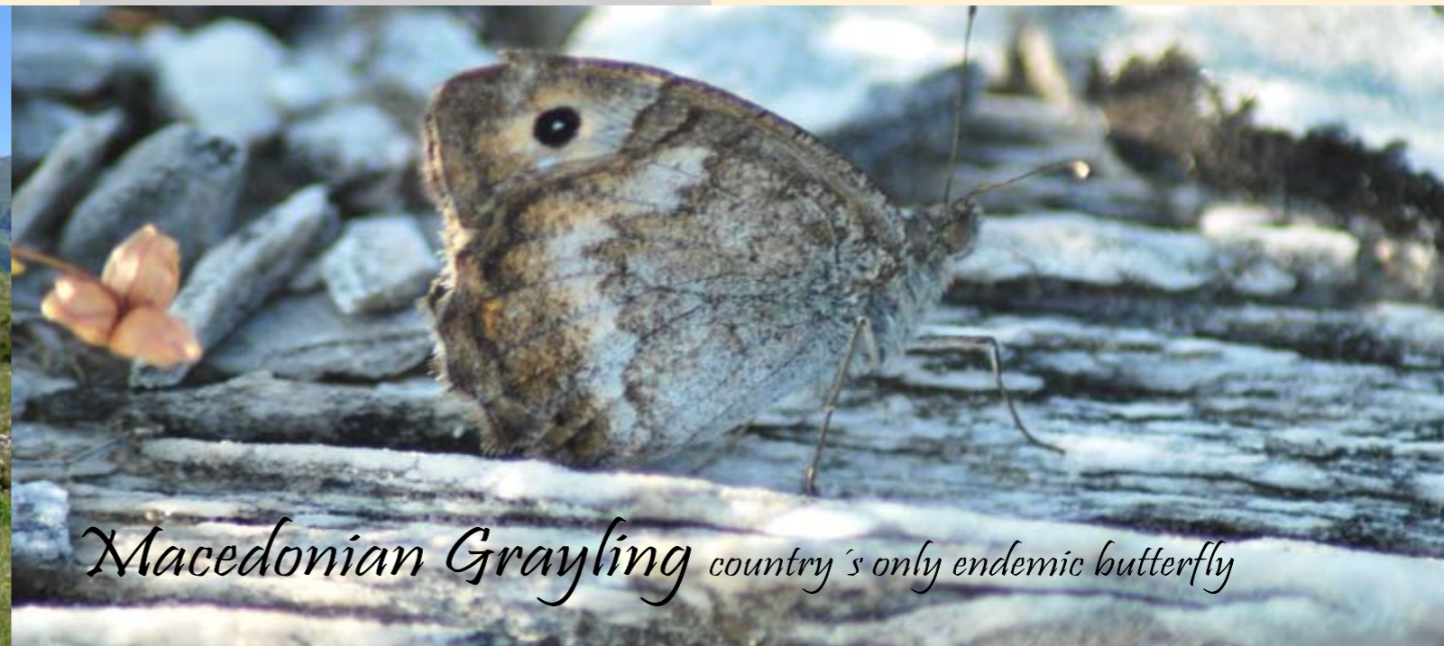
Macedonian Grayling country's only endemic butterfly